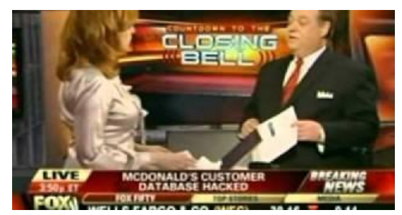
Fox Business "Closing Bell"