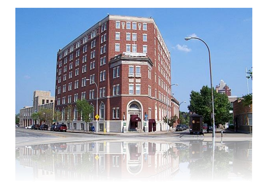
Harro East Building est. 1931