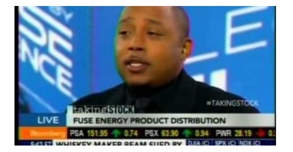
Bloomberg Television "Taking Stock"