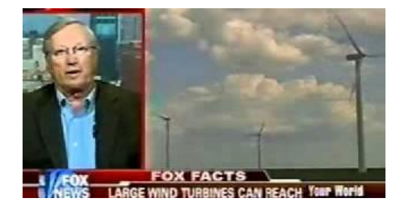
Fox News "Your World with Neil Cavuto"