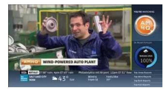
The Weather Channel

We have secured prime-time, live Business Television interviews for our clients, providing them with a national platform on which to tell their story to millions of investors.